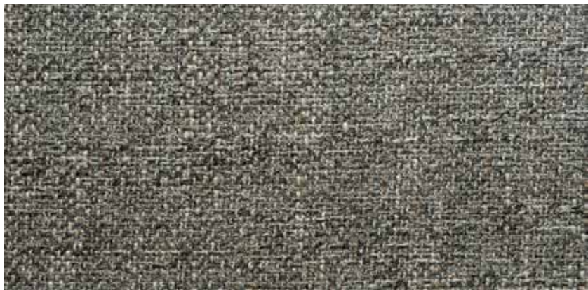
Coco 919 Zinc