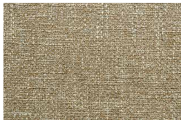
Coco 925 Putty