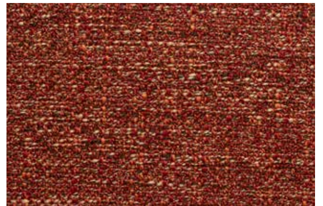
Coco 411 Spice