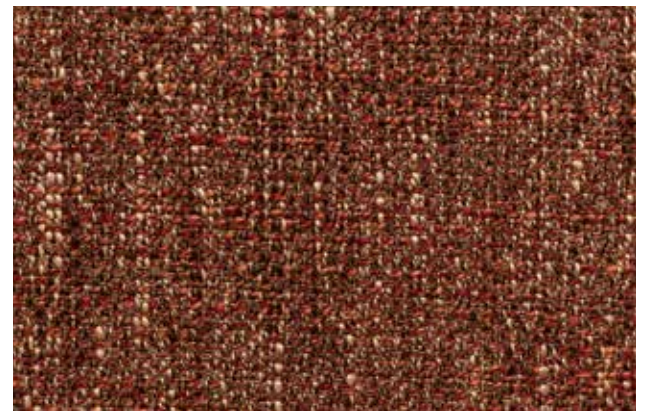
Coco 436 Paprika