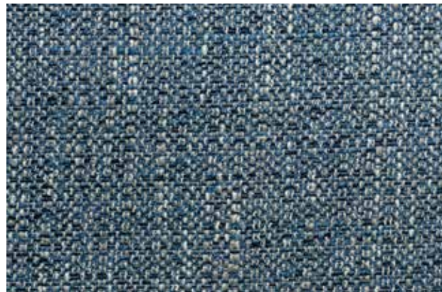
Coco 110 Pacific