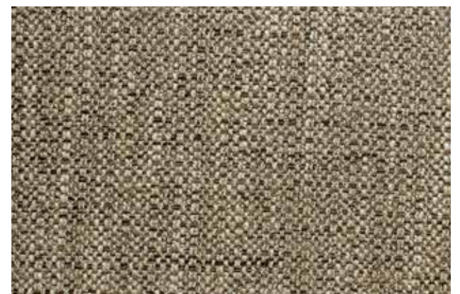
Coco 709 Pecan