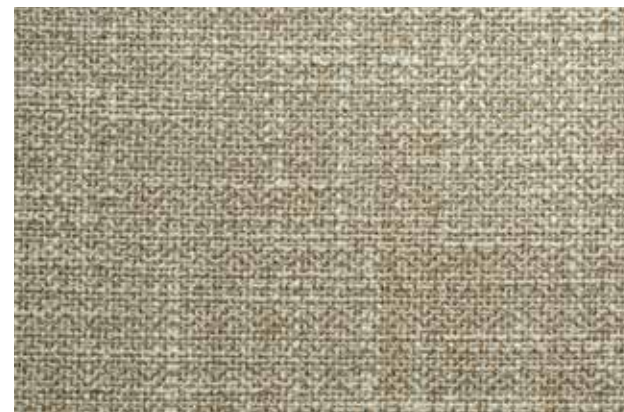
Coco 508 Ivory