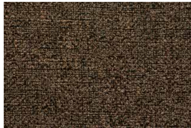
Coco 814 Espresso