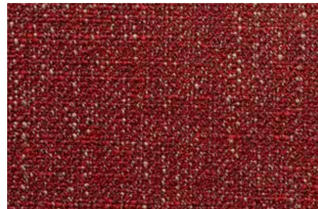
Coco 446 Redcurrant