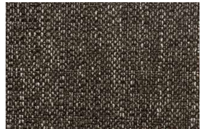
Coco 911 Steel