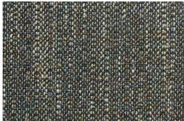
Coco 122 Wedgewood Blue