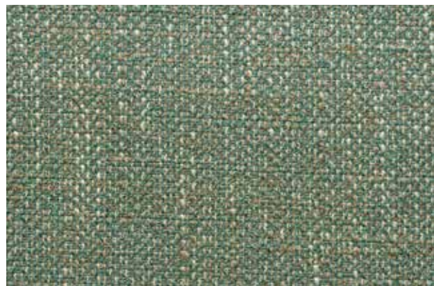
Coco 155 Duck Egg Blue