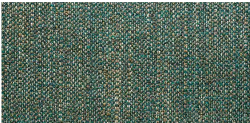
Coco 111 Peacock