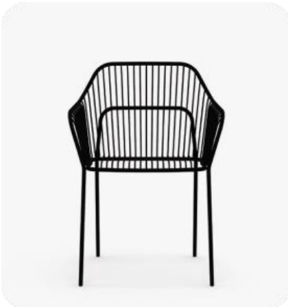
CRP02 Crop armchair

In accordance with EN 15804+A2 and ISO 14040 / ISO 14044