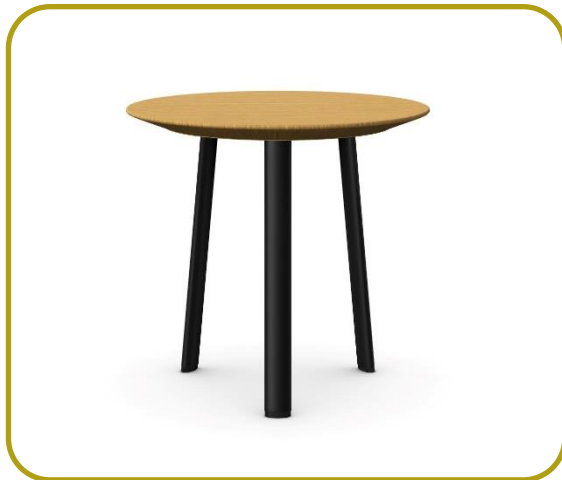
Sunda 2- SUN204

In accordance with EN 15804+A2 and ISO 14040 / ISO 14044